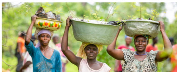
Sunkpa Shea Women's Cooperative